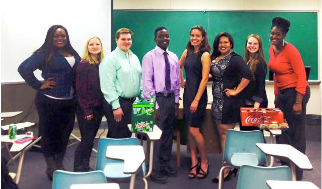
New members of Kappa Mu, WVWC chapter.

Our group raised money for Hope, Inc. the WV organization that funds and provides shelter and services to battered women in WV.