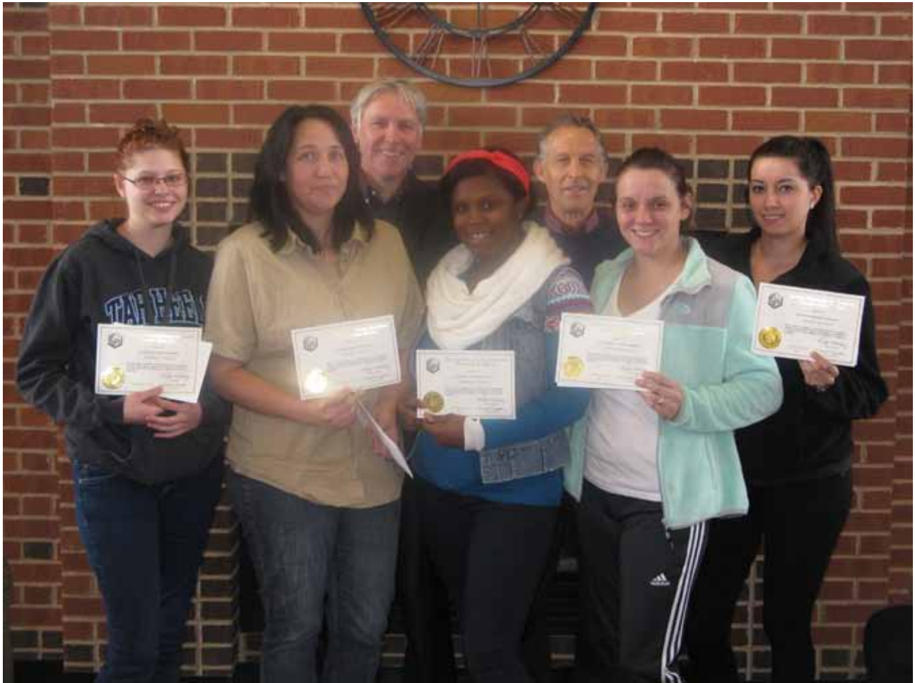
New member initiation ceremony