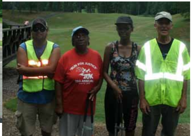
Goodyear Blvd. trash cleanup