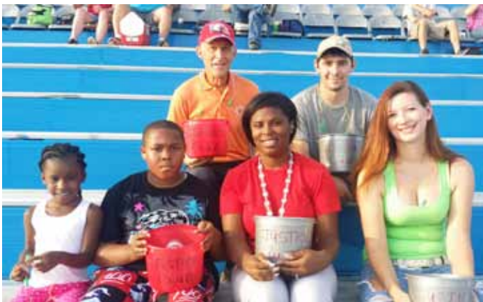
South Boston Speedway "50-50"