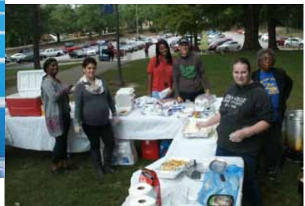
Fall "Fish Fry" at Danville CC