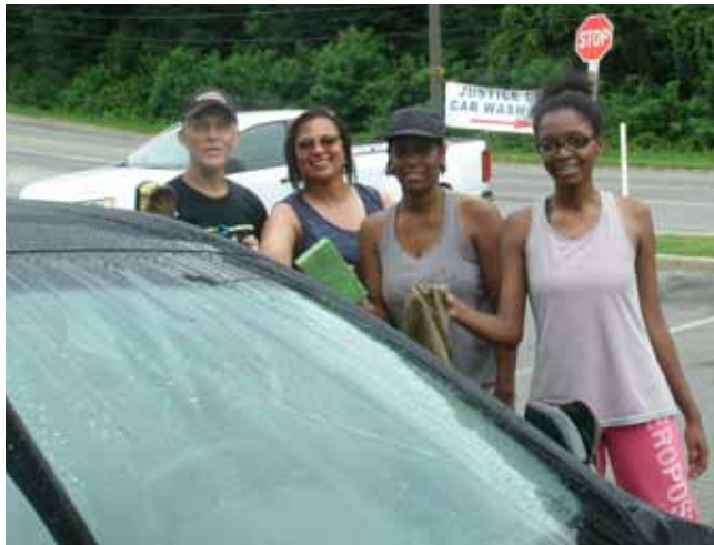
Car wash in South Boston, VA