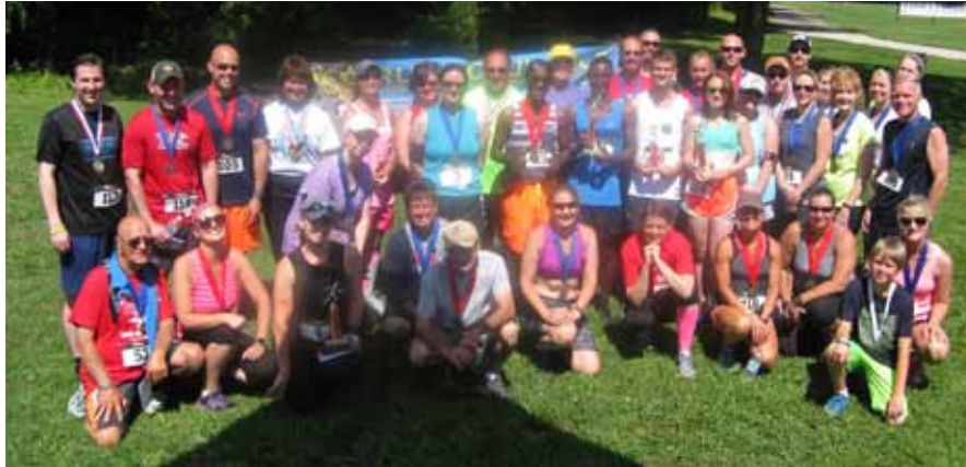
15th Annual "Run for Justice"—2K, 5K walk or run & 10K run